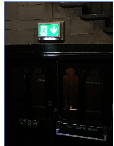
New NW stairwell emergency light

We have also installed three additional emergency lights: at the bottom of the north-west stairwell; in the halls’ kitchen corridor and in the corridor behind the Sanctuary at the Dryburgh Avenue door. These also offer the advantage of providing permanent background lighting for those locking up at night.