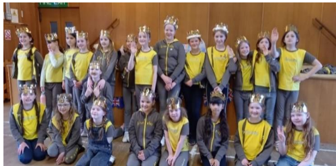
We celebrated the King's Coronation by making crowns