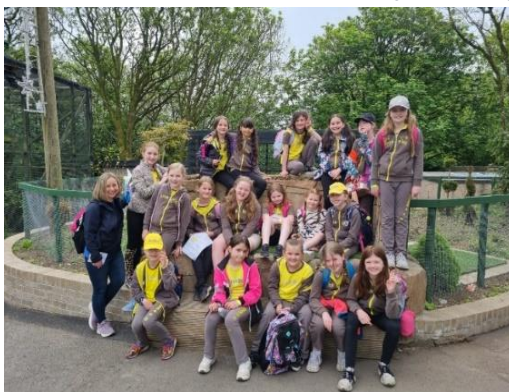
End of term trip to the Five Sisters Zoo, West Calder